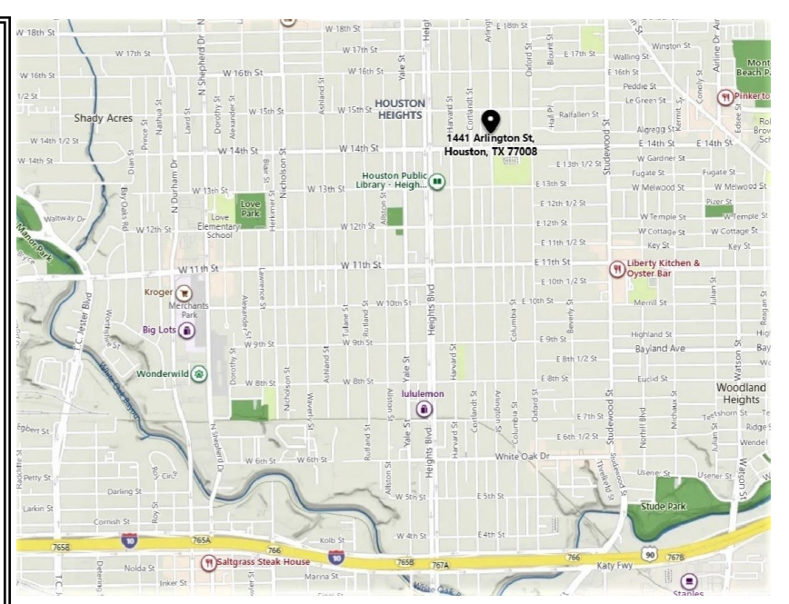
Immanuel Lutheran Church 306 E. 15<sup>th</sup> Street

Make checks payable to Houston Conchology Society and send to the treasurer whose address is listed on the form.