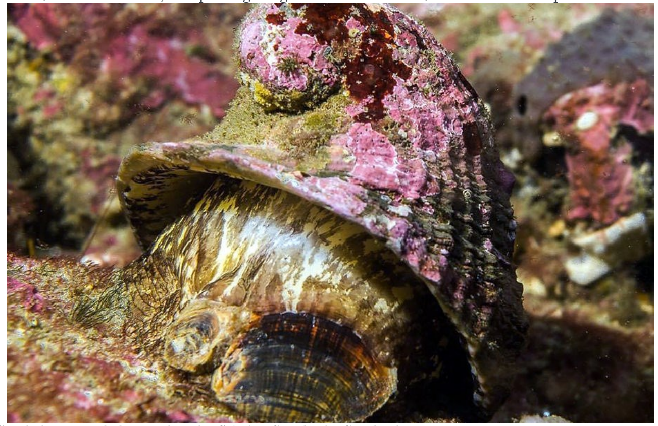
Concholepas concholepas.

For a few years now, the Senckenberg Museum Frankfurt, the LOEWE Center for Translational Biodiversity Genomics (TBG), and Unitas Malacologica have been promoting the election of "Mollusks of the Year." The endeavor is non-discriminatory: Anyone can nominate their favorite species, from any geographic area. Species from marine, land, and freshwater environments are eligible. The selection takes place in March ever year, and TBG will sequence the complete genome (the entire DNA, comprising all genetic information) of the selected species.