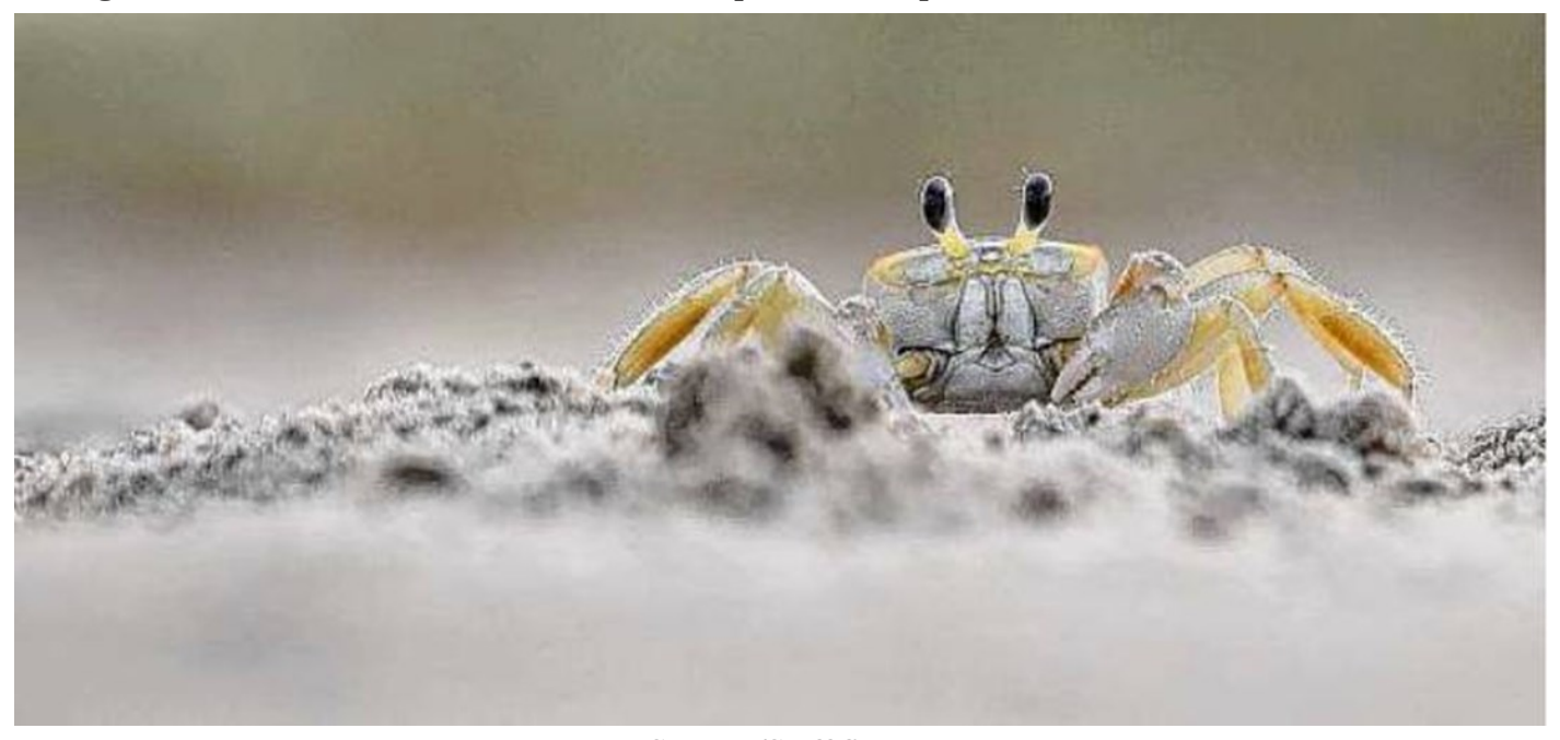
A ghost crab walks across mud flats in June 2021 at Boca Chica State Park near Brownsville.

But because ghost crabs are mostly nocturnal and tend to shy away from humans, odds are a beachgoer won't be able to confirm that from personal experience.